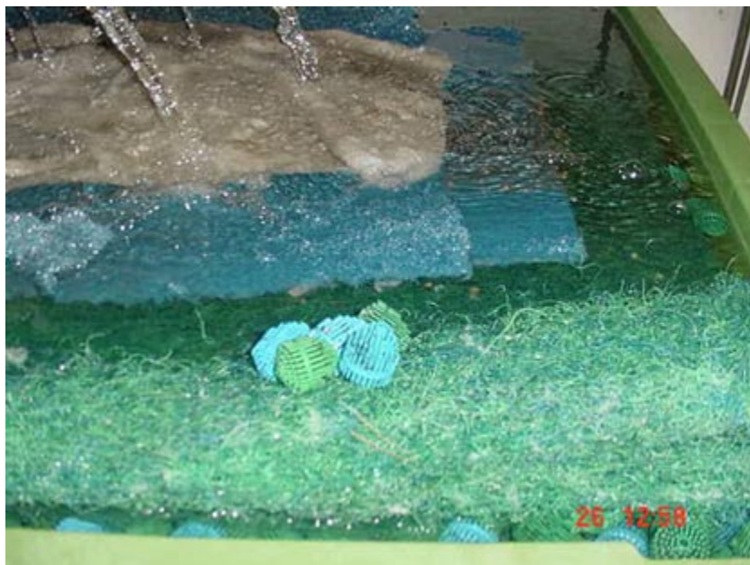
The Bio Balls in the treated system are in immaculate condition