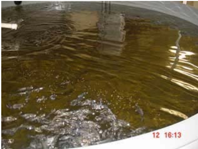
Untreated "control" tank