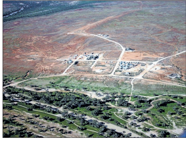
BETTER: Just part of Innamincka Station, SA which found success in treating a salty bore with the Hydrosmart water conditioning system.